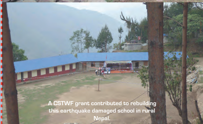
A CSTWF grant contributed to rebuilding this earthquake damaged school in rural Nepal.